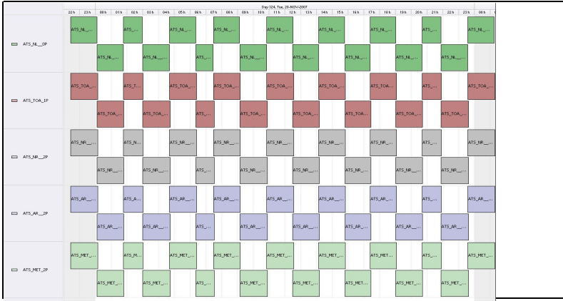
Daily Gantt Chart