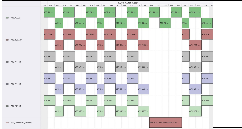
Daily Gantt Chart

Comments Missing L1 data 1500-2000h, unknown cause