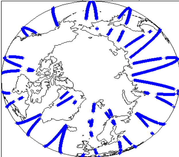
Global Coverage (north pole view)