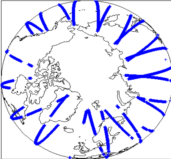
Global Coverage (north pole view)