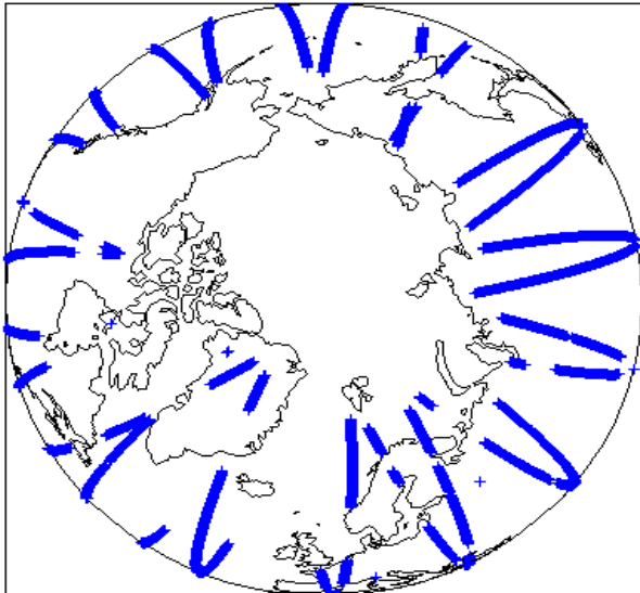
Global Coverage (north pole view)