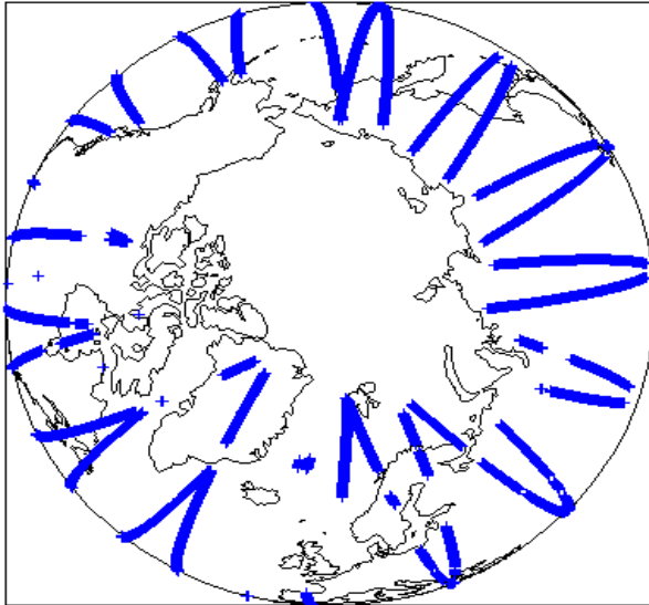
Global Coverage (north pole view)