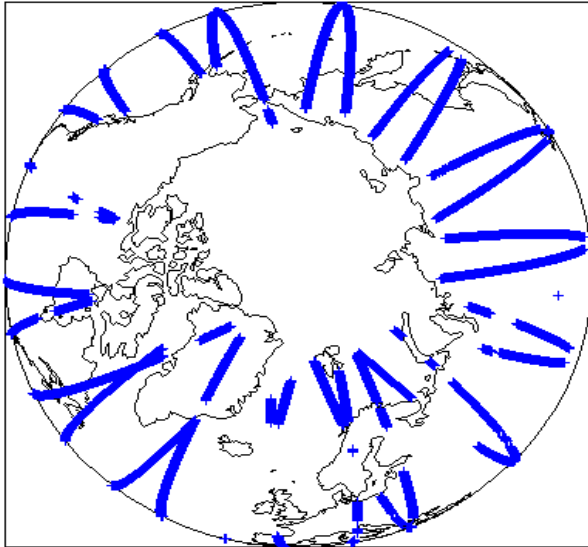
Global Coverage (north pole view)