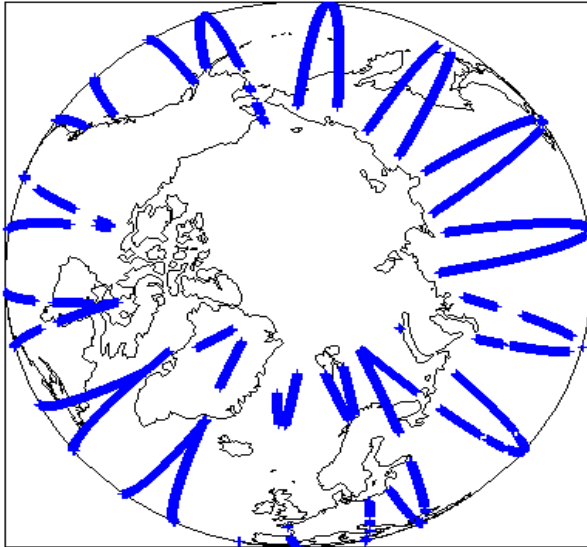
Global Coverage (north pole view)