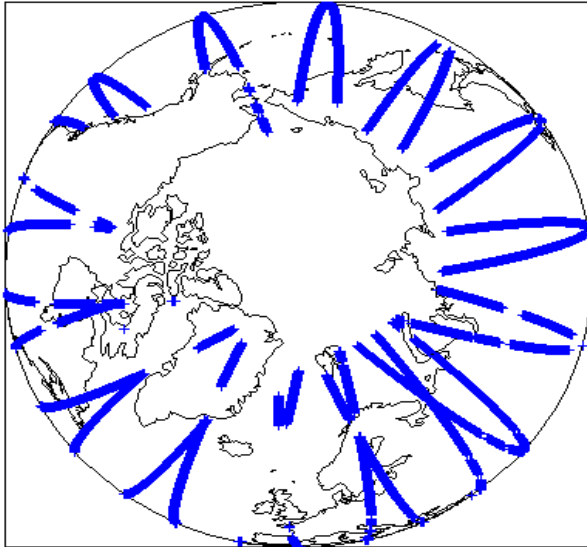
Global Coverage (north pole view)