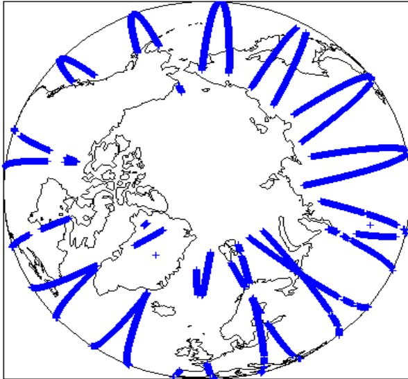
Global Coverage (north pole view)