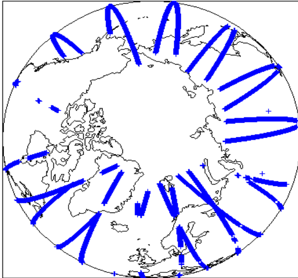
Global Coverage (north pole view)