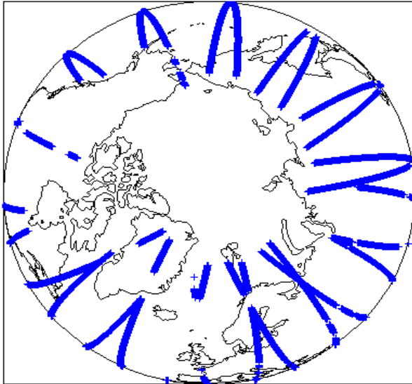
Global Coverage (north pole view)