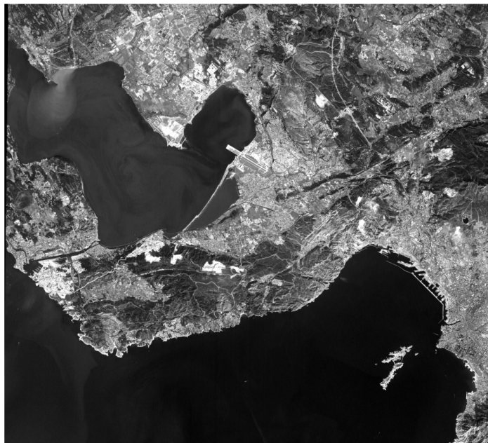
Figure 5-2 – Browse image from ALPSMF060152670-01B2R_UF