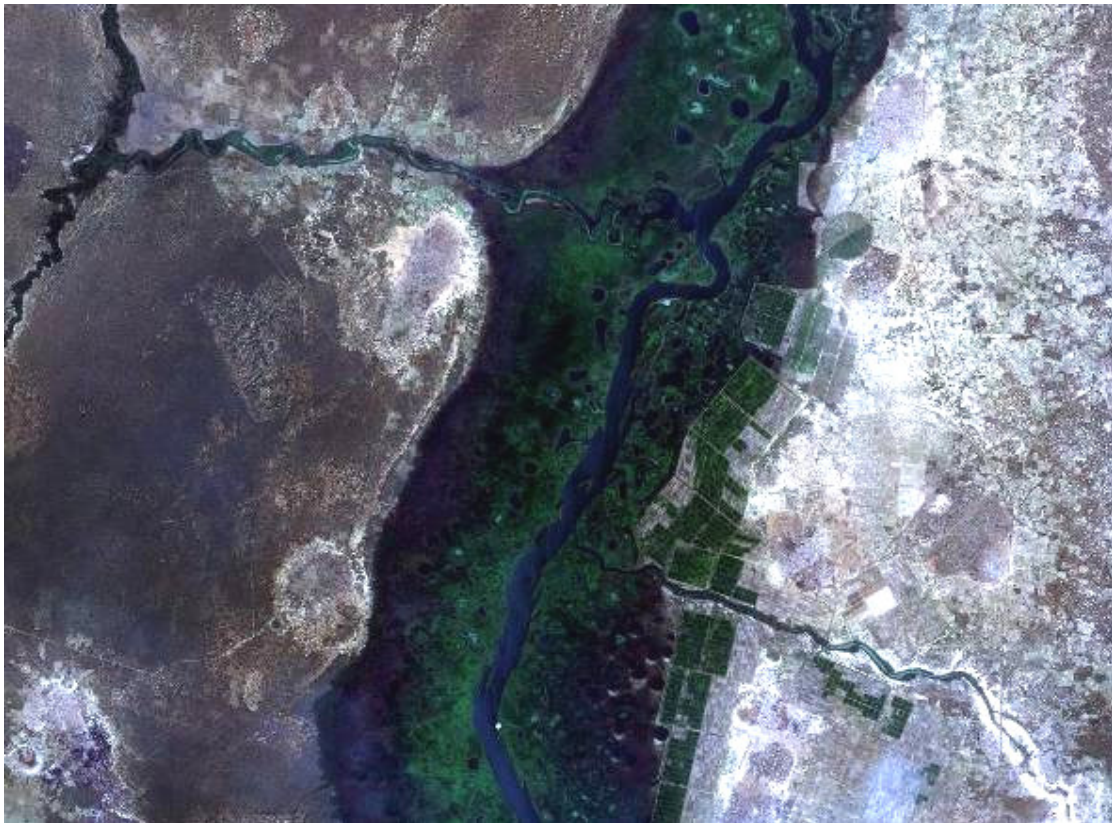
This RGB composite AVNIR-2 image, taken from frame 3330 of orbit 14563 shows the Sourou River in the Volta basin on its course through the Mopti region of Mali near the border with Burkina Faso.

prepared by/ préparé par IDEAS Optical Team reference/ référence AVNIR2_CR_22_080909_081025 issue/ édition 1 Revision/ révision 0 date of issue/ date d'édition 07 November 2008 status/ état Document type/ type de document Technical Note Distribution/ distribution